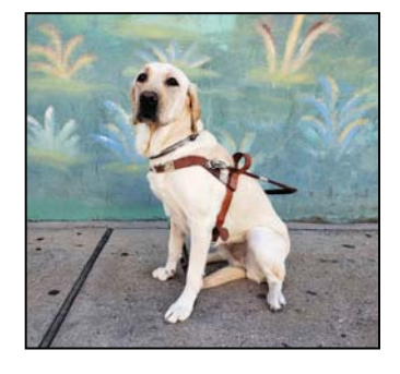
One of my puppies named Smalls

A. The dogs are trained to relieve themselves near the house, on command (the command is get busy ), on the driveway or in the street. That makes it easy for them to become a guide or service dog. There may not be grass where they end up in service. When we walk, the dog leads; it doesn't heel. We don't stop and sniff