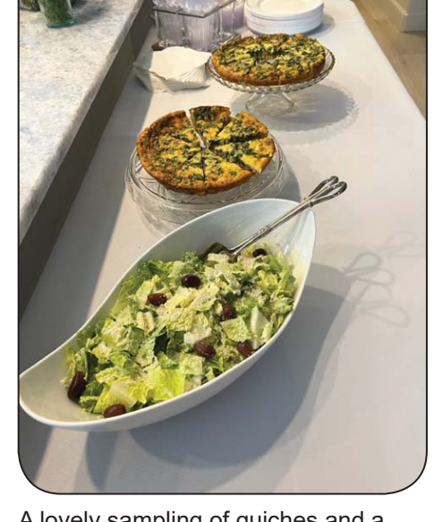
A lovely sampling of quiches and a Caesar salad with Boursin cheese cucumber bites