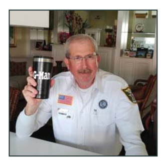
MCSO Crossing Guard