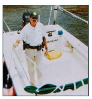
Sheriff's Office, Marine Unit