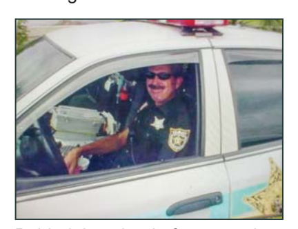
Behind the wheel of my patrol car