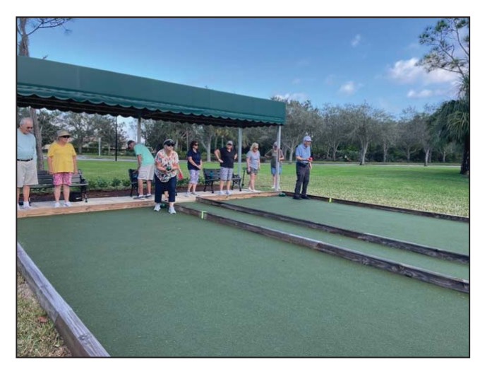
Another Monday morning go on the courts