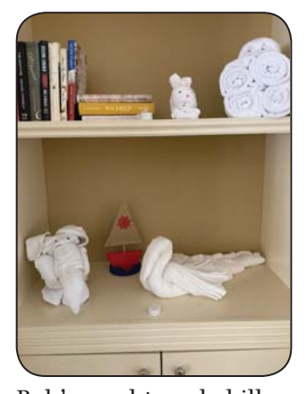
Bob's mad towel skills