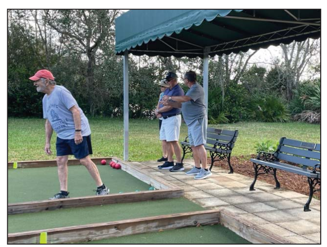
... and throw