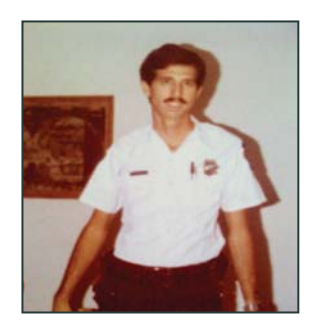
PBC Park Ranger