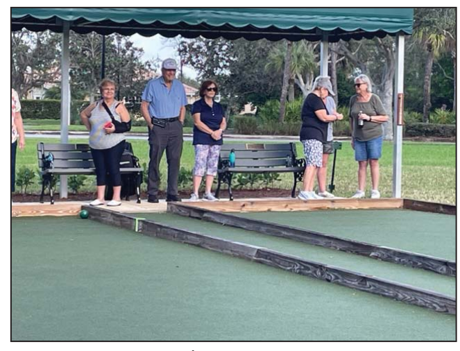
One person goes at a time

I want to thank the readers who contributed to this issue with stories of their work experience, whether you're actively working or happily retired. For next issue, please consider sharing your favorite picture. It could be a nature shot, a grandchild, a historic photo or a vacation memory, etc. As always, a photo and a paragraph or two would be appreciated!